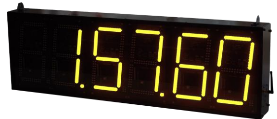
Option: Large Scoreboard 205