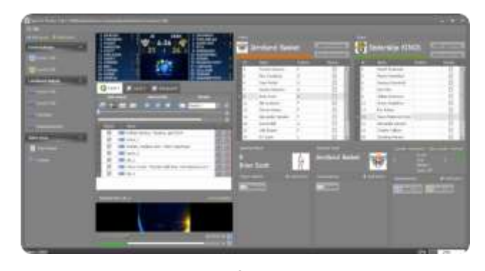
Sport In The Box Interface