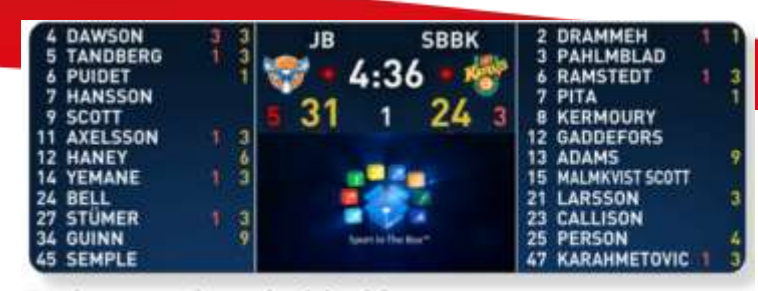
Basket scoreboard with video

Custom graphics can be implemented upon request.