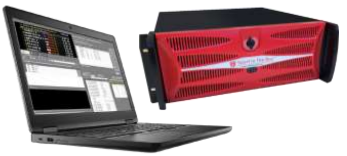
Sport In The Box Laptop & Rack Mount Computer