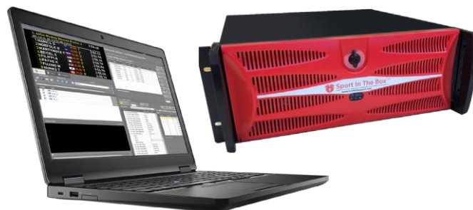
Sport In The Box Laptop & Rack Mount Computer