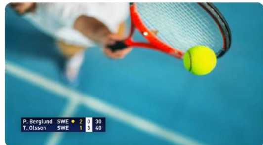
Results overlay - Tennis