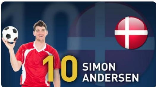
Player presentation scoreboard - Football