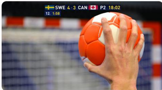
Results overlay - Handball