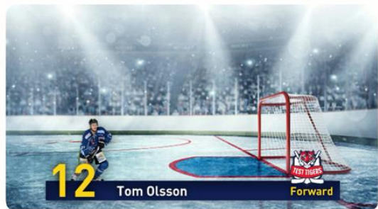
Player presentation overlay - Hockey