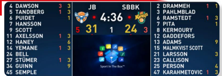
Basket scoreboard with video

Custom graphics can be implemented upon request.