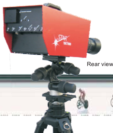
Examples of STAR Photofinish resulting screens